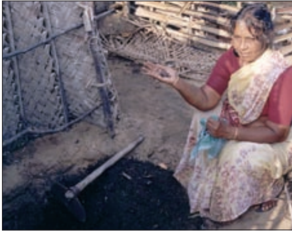
Figure 5. Vermi-compost in Vellapatti village, Tuticorin, India.