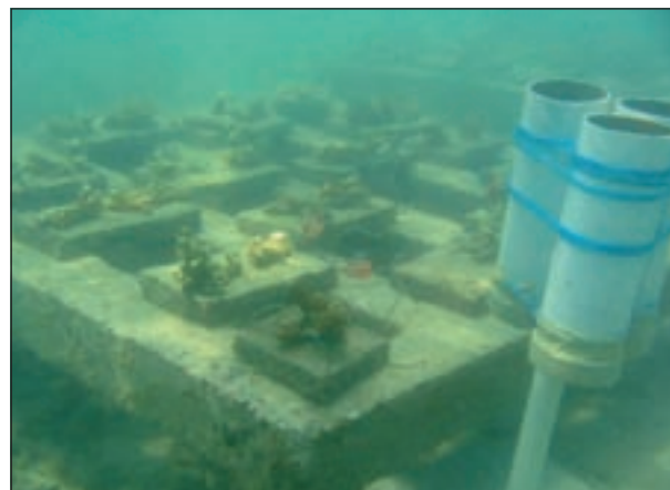
Figure 4. Transplanted corals, Tuticorin, India.