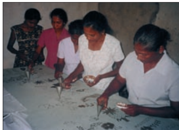
Figure 8. Coral miners receive training in batik production at Rekawa, Sri Lanka.

At Rekawa in southern Sri Lanka, coral mining is extensive (Perera, 2004; TCP, 2004). Large areas of the reef have been turned into plateaus of shifting sediments and, as a consequence, beach erosion in the area is severe. Coral mining was temporarily curtailed in mid-1990s through increased law enforcement, which resulted in