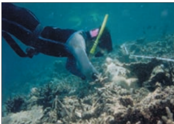
Figure 2. Coral reef monitoring in the Maldives.

In terms of live coral cover, the reefs of the Maldives are recovering at varying rates after the mass bleaching