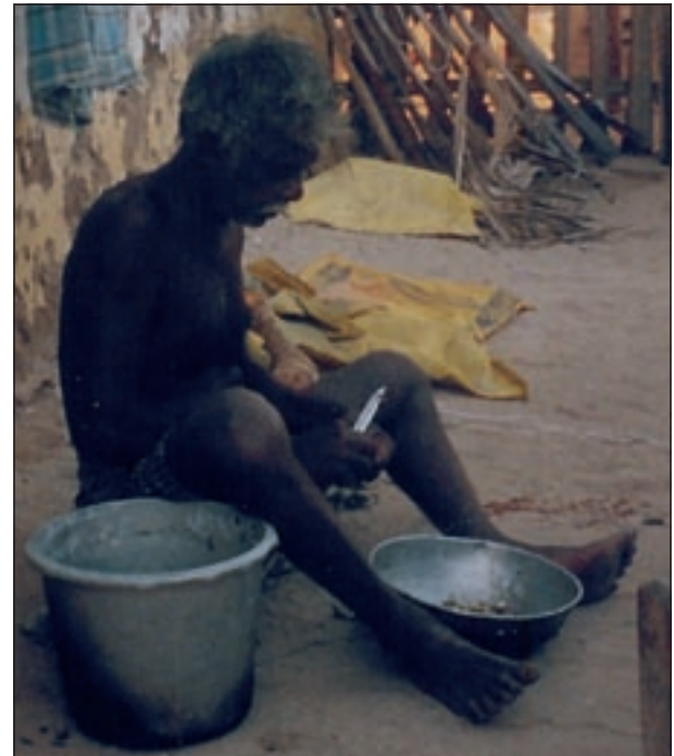
Figure 7. Fisherman in Vellapatti village preparing gastropods.

volume). Moreover, coral mining activities at Vellapatti and blast fishing at Thirespuram have ceased completely as a direct result of this and earlier education campaigns. Also, in Tharuvaikalam, the fisherwomen are now strongly opposing coral mining (Patterson et al. , this volume).