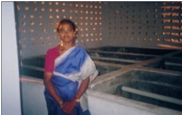
Figure 6. Crab fattening tanks in Vellapatti village, Tuticorin, India.

During 2002 and 2003, SDMRI conducted a series of awareness raising programmes on the importance of sustaining reef productivity in a number of villages along the Tuticorin Coast. Fisherwomen organised in 'Self Help Groups', who play a vital social role in these communities, constituted the main target group. Surveys investigating the degree of awareness of coral reef related issues conducted in the villages before and after the campaign showed a substantial increase in knowledge among the community members (Patterson et al. , this